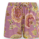
BOB Matata 51.501.553 - XS 51.501.554 - S 51.501.555 - M 51.501.556 - L 51.501.557 - XL 51.501.558 - XXL