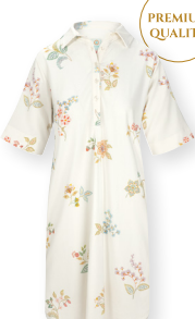
DEWI Blossom Chique 51.504.591 - XS 51.504.592 - S 51.504.593 - M 51.504.594 - L 51.504.595 - XL 51.504.596 - XXL