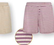
BOBI Little Sumo Stripe 51.501.577 - XS 51.501.578 - S 51.501.579 - M 51.501.580 - L 51.501.581 - XL 51.501.582 - XXL