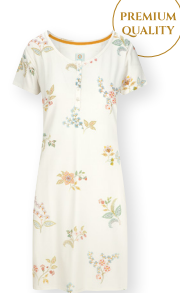
DAISY Blossom Chique 51.504.579 - XS 51.504.580 - S 51.504.581 - M 51.504.582 - L 51.504.583 - XL 51.504.584 - XXL