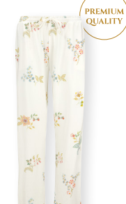
BELIN Blossom Chique 51.600.427 - XS 51.600.428 - S 51.600.429 - M 51.600.430 - L 51.600.431 - XL 51.600.432 - XXL