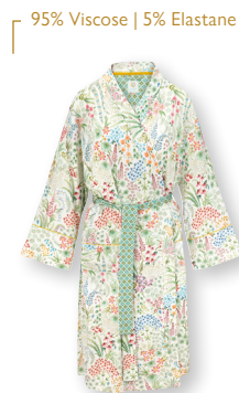
NISHA Matata 51.510.749 - XS 51.510.750 - S 51.510.751 - M 51.510.752 - L 51.510.753 - XL 51.510.754 - XXL