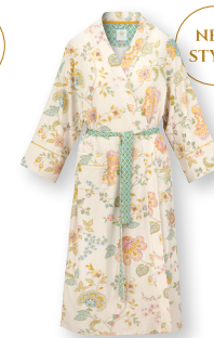
NAOMI Ashanti 51.510.797 - XS 51.510.798 - S 51.510.799 - M 51.510.800 - L 51.510.801 - XL 51.510.802 - XXL