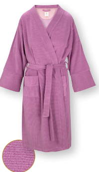
NAOMI Querida 51.510.773 - XS 51.510.762 - S 51.510.763 - M 51.510.764 - L 51.510.765 - XL 51.510.766 - XXL