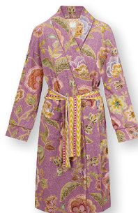
NISHA Jameela 51.510.755 - XS 51.510.756 - S 51.510.757 - M 51.510.758 - L 51.510.759 - XL 51.510.760 - XXL