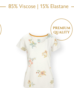
BO Blossom Chique 51.510.541 - XS 51.510.542 - S 51.510.543 - M 51.510.544 - L 51.510.545 - XL 51.510.546 - XXL