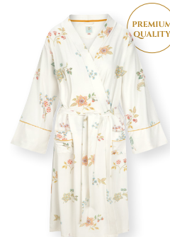
NAOMI Blossom Chique 51.510.767 - XS 51.510.768 - S 51.510.769 - M 51.510.770 - L 51.510.771 - XL 51.510.772 - XXL