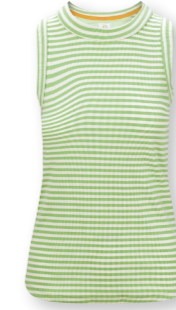
TRINITY Sleeveless Top Little Sumo Stripe Green 100% Cotton