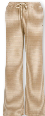
BRITTA Long Trousers Little Sumo Stripe Sand 80% Cotton | 20% Polyester