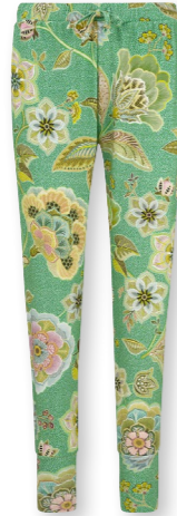
BOBIEN Long Trousers Matata Green 95% Viscose | 5% Elastane