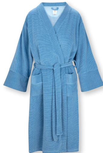
NAOMI Kimono Petite Sumo Stripe Blue 80% Cotton | 20% Polyester