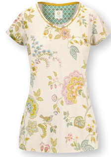
TOY Short Sleeve Top Buenas Noches White 95% Viscose | 5% Elastane