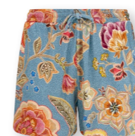
BOB Short Trousers Matata Blue 95% Viscose | 5% Elastane