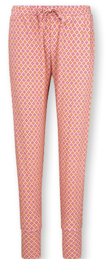
BOBIEN Long Trousers Mojo Pink 95% Viscose | 5% Elastane