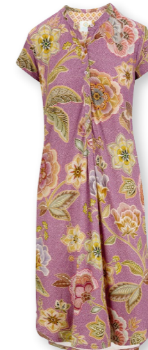
DALIA Short Sleeve Nightdress Matata Lilac 95% Viscose | 5% Elastane