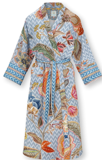
NOA Kimono Hakuna Blue 100% Cotton