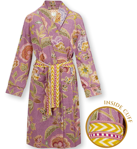
NISHA Kimono Matata Lilac 95% Viscose | 5% Elastane