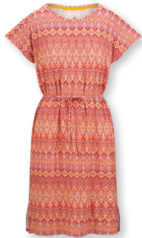
DIDI Tunic Ashanti Red 95% Viscose | 5% Elastane