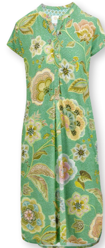
DALIA Short Sleeve Nightdress Matata Green 95% Viscose | 5% Elastane