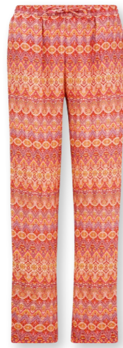
BELIN Long Trousers Ashanti Red 100% Cotton