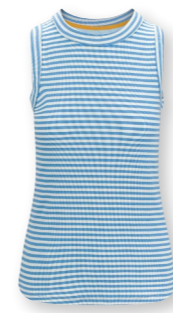
TRINITY Sleeveless Top Little Sumo Stripe Blue 100% Cotton