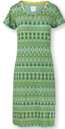
DANIELA Short Sleeve Nightdress Ashanti Green 95% Viscose | 5% Elastane