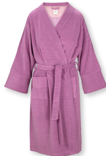
NAOMI Kimono Petite Sumo Stripe Lilac 80% Cotton | 20% Polyester