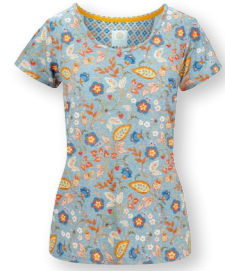
TILLY Short Sleeve Top Jameela Blue 95% Viscose | 5% Elastane