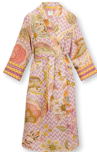
NOA Kimono Hakuna Lilac 100% Cotton