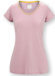
TOY Short Sleeve Top Solid Lilac 95% Viscose | 5% Elastane