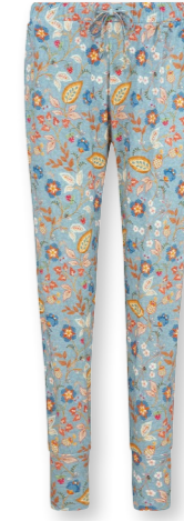
BOBIEN Long Trousers Jameela Blue 95% Viscose | 5% Elastane