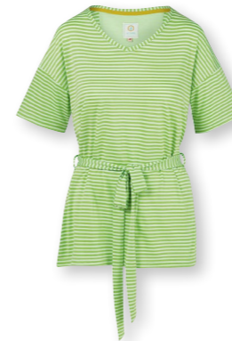
TONYA Short Sleeve Top Little Sumo Stripe Green 48% Viscose | 48% Polyester | 4% Elastane