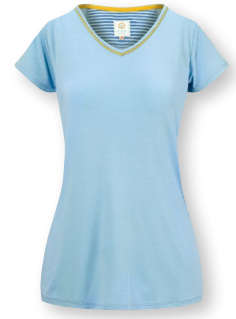
TOY Short Sleeve Top Solid Blue 95% Viscose | 5% Elastane