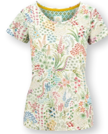
TILLY Short Sleeve Top Querida White 95% Viscose | 5% Elastane