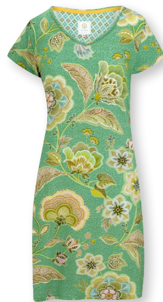
DJOY Short Sleeve Nightdress Matata Green 95% Viscose | 5% Elastane