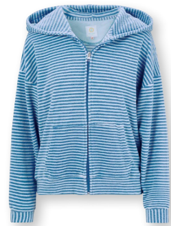
NICOLLE Jacket Little Sumo Stripe Blue 80% Cotton | 20% Polyester