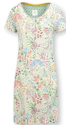
DAISY Short Sleeve Nightdress Querida White 95% Viscose | 5% Elastane