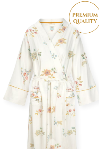
NAOMI Kimono Blossom Chique White 85% Viscose | 15% Elastane