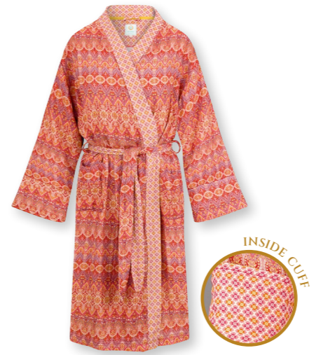
NAOMI Kimono Ashanti Red 100% Cotton