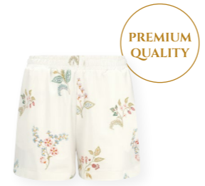
BO Short Trousers Blossom Chique White 85% Viscose | 15% Elastane