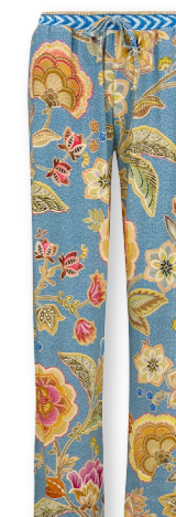
BELIN Long Trousers Matata Blue 95% Viscose | 5% Elastane