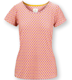
TILLY Short Sleeve Top Mojo Pink 95% Viscose | 5% Elastane