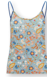
SELINA Sleeveless Top Jameela Blue 95% Viscose | 5% Elastane