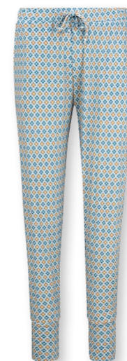
BOBIEN Long Trousers Mojo Blue 95% Viscose | 5% Elastane