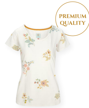
TILLY Short Sleeve Top Blossom Chique White 85% Viscose | 15% Elastane