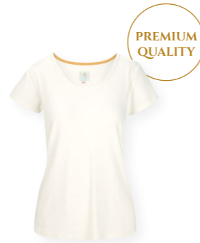
TILLY Tilly Short Sleeve Top Solid White 85% Viscose | 15% Elastane