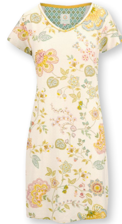
DJOY Short Sleeve Nightdress Buenas Noches White 95% Viscose | 5% Elastane