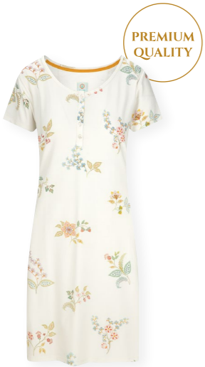
DAISY Short Sleeve Nightdress Blossom Chique White 85% Viscose | 15% Elastane