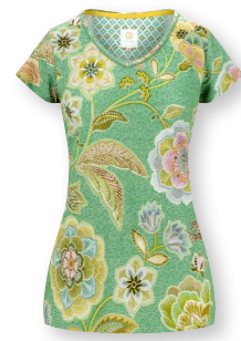
TOY Short Sleeve Top Matata Green 95% Viscose | 5% Elastane