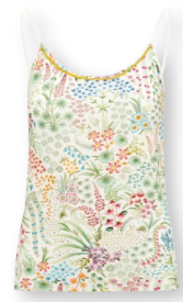
SELINA Sleeveless Top Querida White 95% Viscose | 5% Elastane