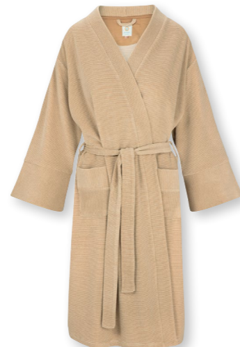
NAOMI Kimono Petite Sumo Stripe Sand 80% Cotton | 20% Polyester