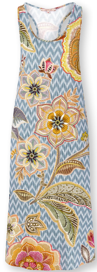
DAMARA Sleeveless Nightdress Hakuna Blue 95% Viscose | 5% Elastane