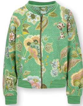
NICOS Jacket Matata Green 95% Cotton | 5% Elastane