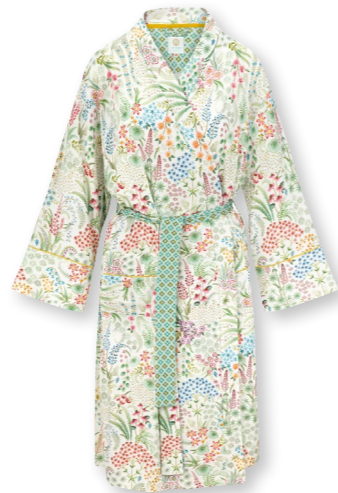
NAOMI Kimono Querida White 95% Viscose | 5% Elastane