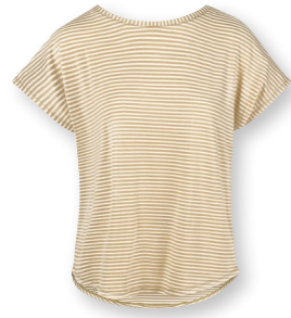
TATUM Short Sleeve Top Little Sumo Stripe Sand 48% Viscose | 48% Polyester | 4% Elastane