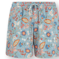
BOB Short Trousers Jameela Blue 95% Viscose | 5% Elastane