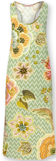
DAMARA Sleeveless Nightdress Hakuna Light Green 95% Viscose | 5% Elastane