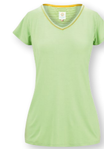
TOY Short Sleeve Top Solid Green 95% Viscose | 5% Elastane