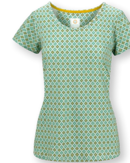
TILLY Short Sleeve Top Mojo Green 95% Viscose | 5% Elastane