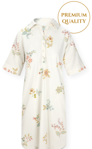
DEWI Short Sleeve Nightdress Blossom Chique White 85% Viscose | 15% Elastane