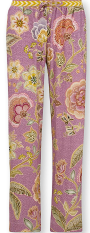
BELIN Long Trousers Matata Lilac 95% Viscose | 5% Elastane