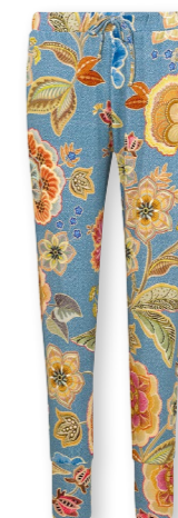
BOBIEN Long Trousers Matata Blue 95% Viscose | 5% Elastane