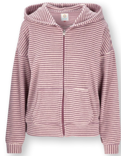
NICOLLE Jacket Little Sumo Stripe Lilac 80% Cotton | 20% Polyester