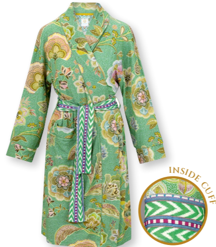
NISHA Kimono Matata Green 95% Viscose | 5% Elastane