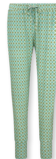
BOBIEN Long Trousers Mojo Green 95% Viscose | 5% Elastane