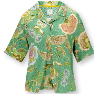
FLORA Short Sleeve Top Matata Green 95% Viscose | 5% Elastane