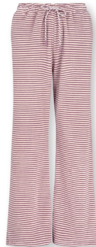
BRITTA Long Trousers Little Sumo Stripe Lilac 80% Cotton | 20% Polyester