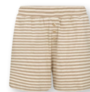
BOBI Short Trousers Little Sumo Stripe Sand 100% Cotton