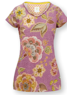
TOY Short Sleeve Top Matata Lilac 95% Viscose | 5% Elastane