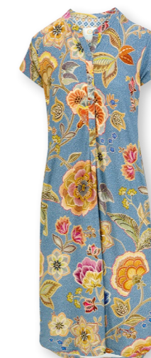
DALIA Short Sleeve Nightdress Matata Blue 95% Viscose | 5% Elastane