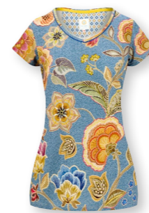
TOY Short Sleeve Top Matata Blue 95% Viscose | 5% Elastane