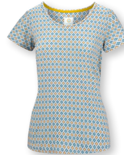
TILLY Short Sleeve Top Mojo Blue 95% Viscose | 5% Elastane