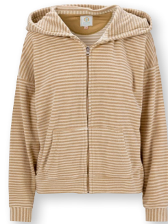
NICOLLE Jacket Little Sumo Stripe Sand 80% Cotton | 20% Polyester