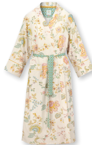
NOA Kimono Buenas Noches White 95% Viscose | 5% Elastane