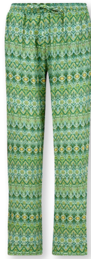
BELIN Long Trousers Ashanti Green 100% Cotton