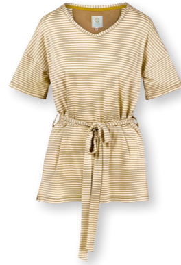
TONYA Short Sleeve Top Little Sumo Stripe Sand 48% Viscose | 48% Polyester | 4% Elastane