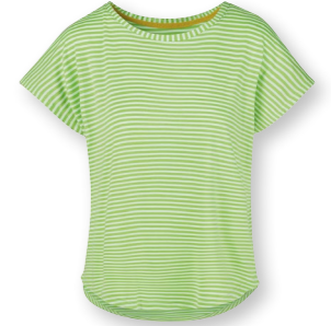
TATUM Short Sleeve Top Little Sumo Stripe Green 48% Viscose | 48% Polyester | 4% Elastane