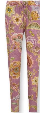
BOBIEN Long Trousers Matata Lilac 95% Viscose | 5% Elastane