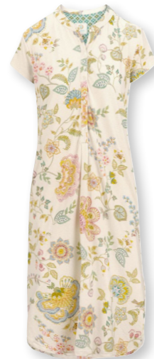
DALIA Short Sleeve Nightdress Buenas Noches White 95% Viscose | 5% Elastane