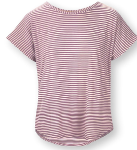
TATUM Short Sleeve Top Little Sumo Stripe Lilac 48% Viscose | 48% Polyester | 4% Elastane