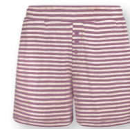
BOBI Short Trousers Little Sumo Stripe Lilac 100% Cotton