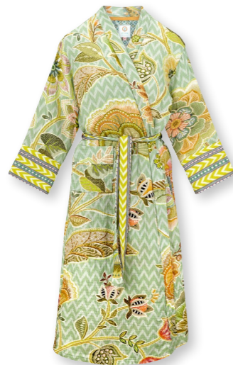
NOA Kimono Hakuna Light Green 100% Cotton