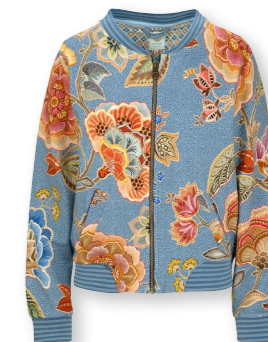
NICOS Jacket Matata Blue 95% Cotton | 5% Elastane