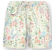
BOB Short Trousers Querida White 95% Viscose | 5% Elastane