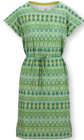
DIDI Tunic Ashanti Green 95% Viscose | 5% Elastane