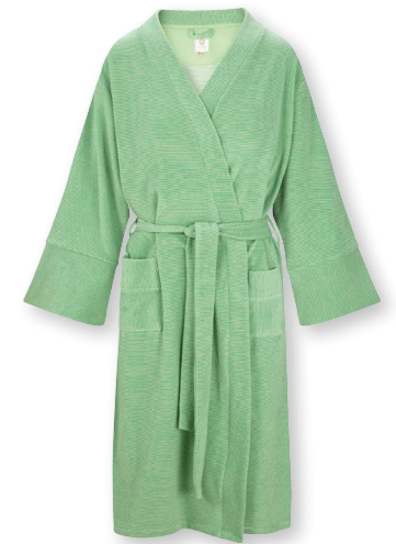
NAOMI Kimono Petite Sumo Stripe Green 80% Cotton | 20% Polyester