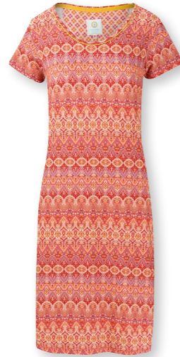
DANIELA Short Sleeve Nightdress Ashanti Red 95% Viscose | 5% Elastane