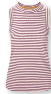
TRINITY Sleeveless Top Little Sumo Stripe Lilac 100% Cotton