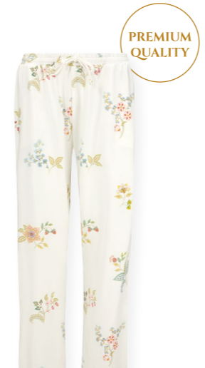
BELIN Long Trousers Blossom Chique White 85% Viscose | 15% Elastane