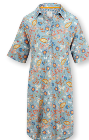
DEWI Short Sleeve Nightdress Jameela Blue 95% Viscose | 5% Elastane