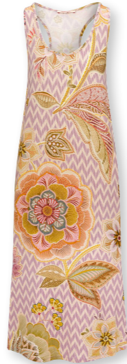
DAMARA Sleeveless Nightdress Hakuna Lilac 95% Viscose | 5% Elastane