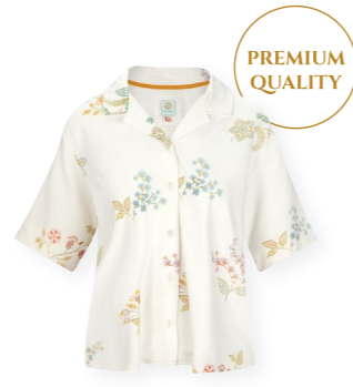
FLORA Short Sleeve Top Blossom Chique White 85% Viscose | 15% Elastane