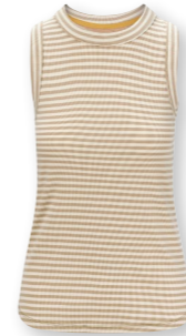
TRINITY Sleeveless Top Little Sumo Stripe Sand 100% Cotton