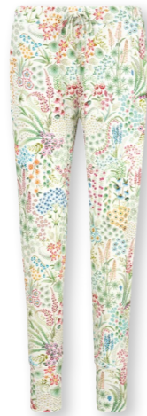
BOBIEN Long Trousers Querida White 95% Viscose | 5% Elastane