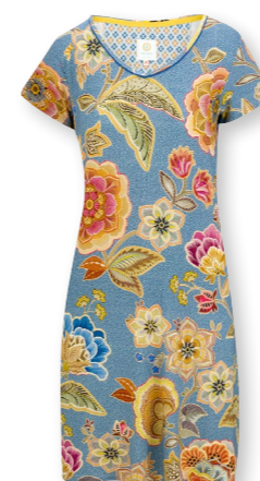
DJOY Short Sleeve Nightdress Matata Blue 95% Viscose | 5% Elastane