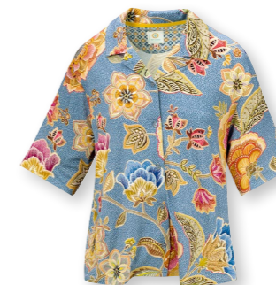
FLORA Short Sleeve Top Matata Blue 95% Viscose | 5% Elastane