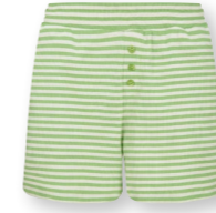
BOBI Short Trousers Little Sumo Stripe Green 100% Cotton