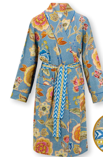
NISHA Kimono Matata Blue 95% Viscose | 5% Elastane