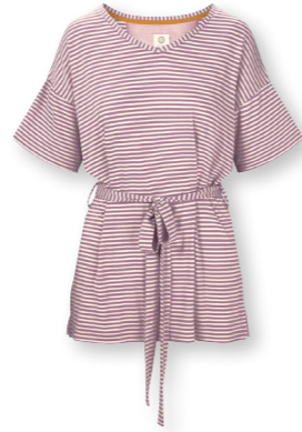
TONYA Short Sleeve Top Little Sumo Stripe Lilac 48% Viscose | 48% Polyester | 4% Elastane