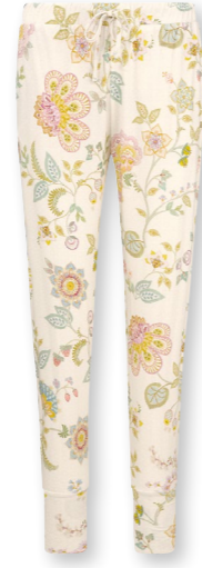
BOBIEN Long Trousers Buenas Noches White 95% Viscose | 5% Elastane