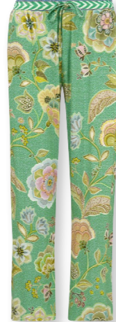
BELIN Long Trousers Matata Green 95% Viscose | 5% Elastane