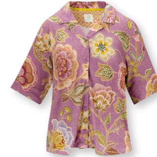
FLORA Short Sleeve Top Matata Lilac 95% Viscose | 5% Elastane