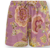
BOB Short Trousers Matata Lilac 95% Viscose | 5% Elastane