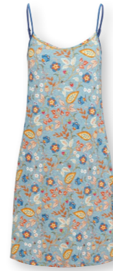
DIEZEL Sleeveless Nightdress Jameela Blue 95% Viscose | 5% Elastane