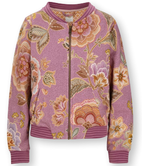
NICOS Jacket Matata Lilac 95% Cotton | 5% Elastane