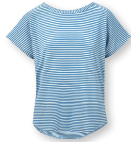
TATUM Short Sleeve Top Little Sumo Stripe Blue 48% Viscose | 48% Polyester | 4% Elastane