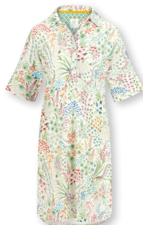
DEWI Short Sleeve Nightdress Querida White 95% Viscose | 5% Elastane