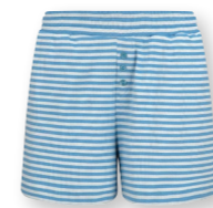
BOBI Short Trousers Little Sumo Stripe Blue 100% Cotton