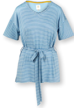
TONYA Short Sleeve Top Little Sumo Stripe Blue 48% Viscose | 48% Polyester | 4% Elastane