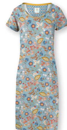
DANIELA Short Sleeve Nightdress Jameela Blue 95% Viscose | 5% Elastane