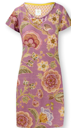
DJOY Short Sleeve Nightdress Matata Lilac 95% Viscose | 5% Elastane