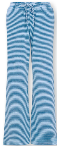
BRITTA Long Trousers Little Sumo Stripe Blue 80% Cotton | 20% Polyester