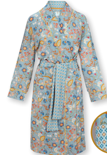
NISHA Kimono Jameela Blue 95% Viscose | 5% Elastane