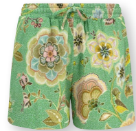
BOB Short Trousers Matata Green 95% Viscose | 5% Elastane