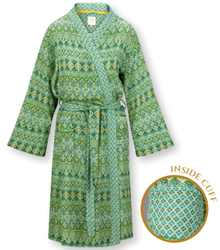
NAOMI Kimono Ashanti Green 100% Cotton